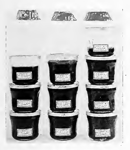
FIGURE 4.—Consistency and Yield of Blackberry Jelly Made with the Addition of Various Amounts of Unripe Berries. Left to right: 10, 15, and 25 percent unripe berries added

It is interesting to note the close relation between these figures and those for percentage of sugar in jellies at the "jelly point," as determined by the spoon test. Thus (Table 14) for jellies made with 1 to 1\frac{1}{2} parts by weight of sugar, the percentage of sugar in the final weight of jelly varies from 58.5 to 66 percent, as against 62 to 66 percent for the method of cooking to weight.